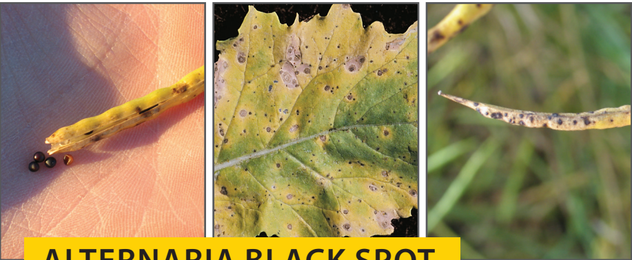
ALTERNARIA BLACK SPOT

worse, or whether the management tools used were effective. This card can help improve the accuracy of risk assessments through enhanced symptom recognition, better understanding of risk factors and improved identification of spore-producing structures and late-season infections. Accurate identification and long-term record keeping of disease information for each field, including the percent of infection and severity of symptoms, will help growers better predict risk and help evaluate, prioritize and improve disease management programs in their fields.