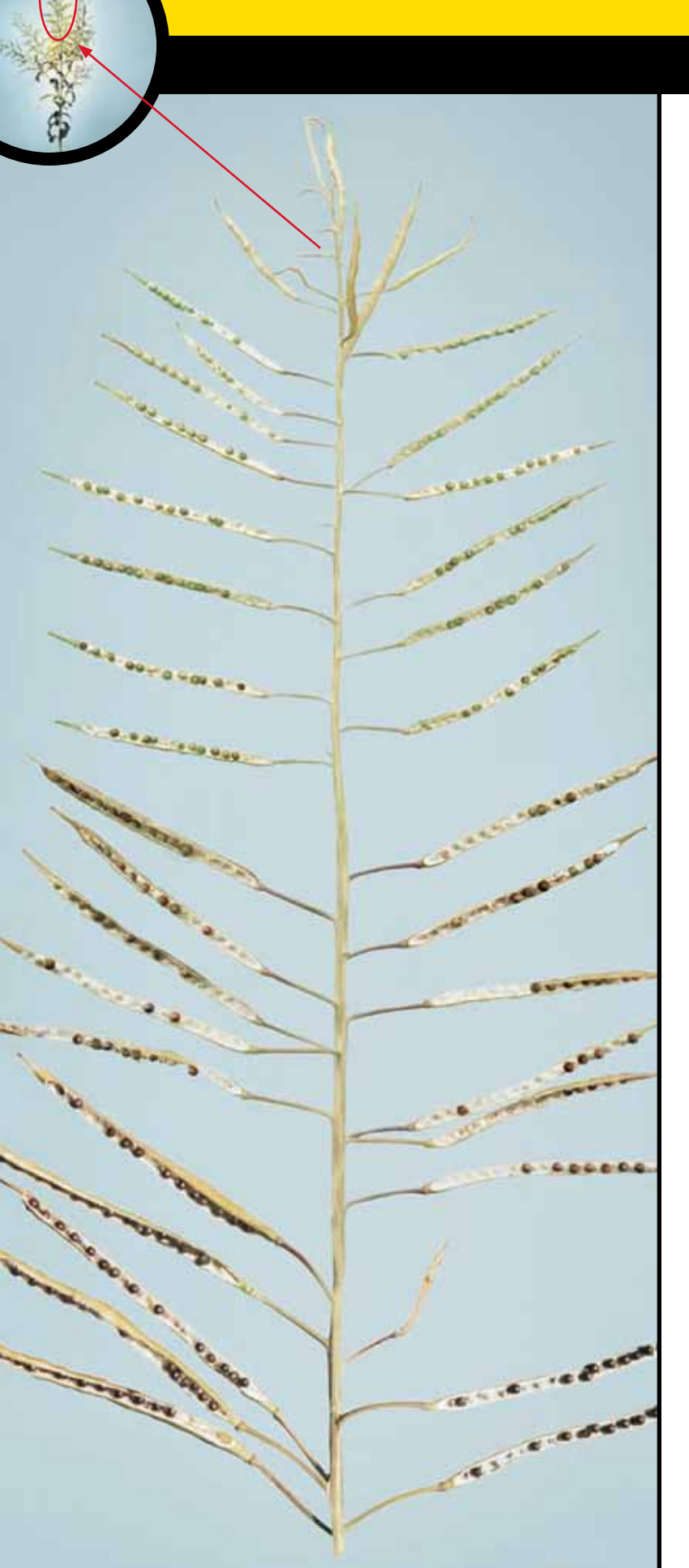
Illustration for determining seed colour change

The seeds in the pods near the top of the plant will look like this.